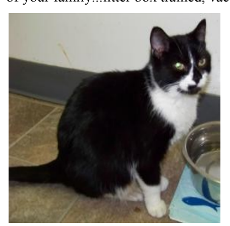
Meet LAYLA—our longest kitty resident. She is so sweet!! We have no idea why she hasn't been adopted yet. Won't YOU give her a loving forever home today?

would find at other locations. Come visit us and see for yourself. When you adopt a kitty from "Wilson's Kitty Korner" you are getting a kitty who is completely ready to become a member of your family...litter box trained, vac-