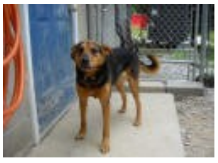
Riley (a total sweetheart)